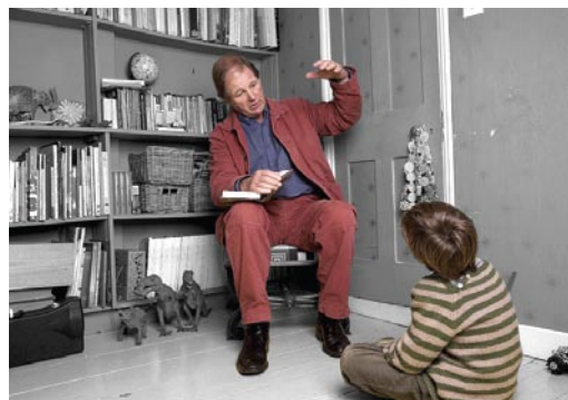
Michael Morpurgo children's author and national CU Chancellor

from business and local government. The national CU Chancellor is the children's author Michael Morpurgo. CU Lectures aim to raise the aspirations of children by giving them the opportunity to experience a tailored lecture delivered by university students, staff or other providers often in a Higher Education setting.