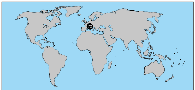
72 CU Service Children's Schools are in Belgium, Belize, Brunei, Canada, Cyprus, Falkland Islands, Gibraltar, Italy, The Netherlands and Turkey, with its head office in Germany.