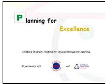
'Planning for Excellence' document cover