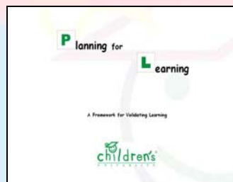
'Planning for Learning' document cover