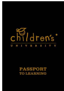
'Passport To Learning' front cover

A national 'Passport To Learning' has been created, in which 7-14 year old children will collect 'stamps' and hours of accredited learning (contributing to the award of a national certificate) to encourage them to access Children's University™ (CU) provision and a wide range of other worthwhile out-of-school-hours learning opportunities. This innovation has received widespread support in principle from potential partners (e.g. Museums, Libraries and Archives, Natural England, National Trust, Royal Shakespeare Company and Youth Music).