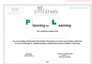
'Planning for Learning' validation certificate

'Planning for Learning' validators will be issued with a national Children's University™ certificate which entitles them to validate learning provision locally on behalf of the national CU and award 'Learning Destination' status. The certificates are linked to the national membership status of the local Children's University™.