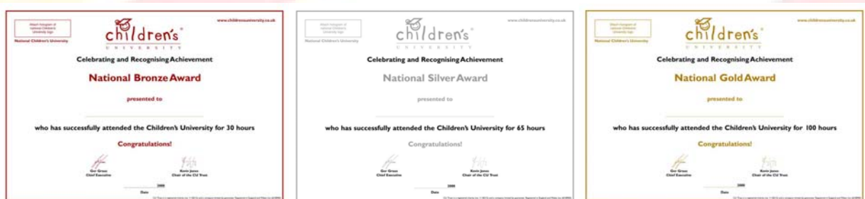
Children's University™ 'National Awards'

The 'stamps' which children collect in their 'Passport To Learning' will be issued by CU validated 'Learning Destinations' and will represent that particular organisation's logo. The 'stamps' will in this way contribute to a child's record of achievement culminating in the presentation of the Children's University™ certificates ('National Awards') for participation in 30 hours (Bronze), 65 hours (Silver) or 100 hours (Gold) of voluntary, quality out-of-school-hours learning. Certificates are typically presented to children at 'graduation' ceremonies in or with the support of 'grown-ups' universities.