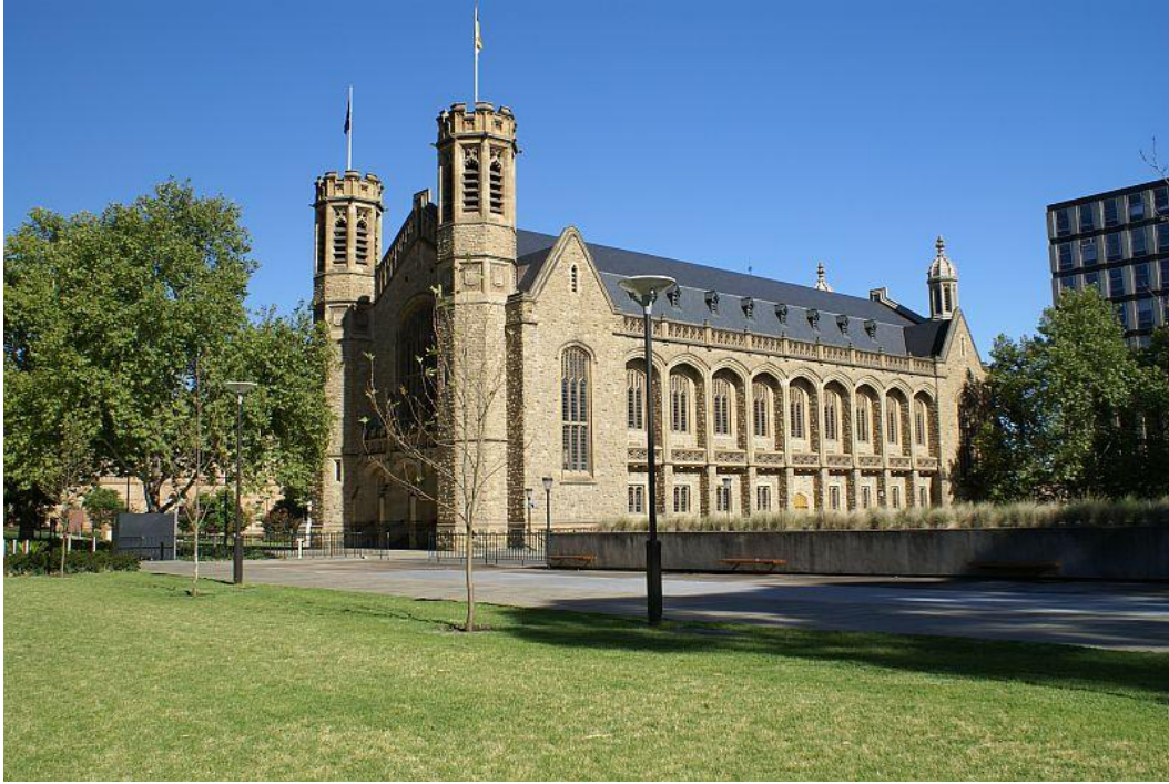
Bonython Hall, the University of Adelaide