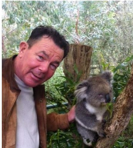
The cute and cuddly one is on the left ...