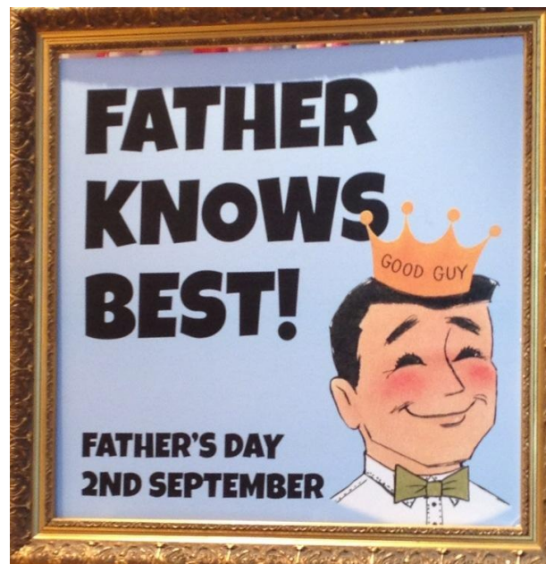
Take note ... I emailed this to my two!! No response as yet...