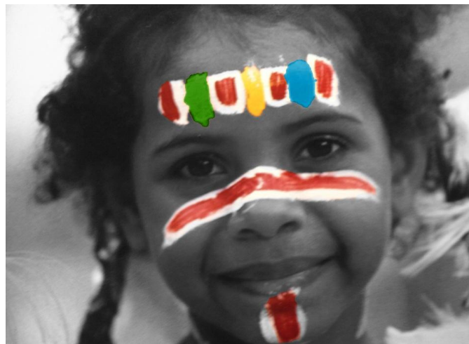
CU Australia in colours ...