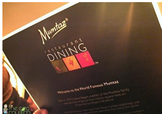
Lunch at Mumtaz in Bradford ... with friends