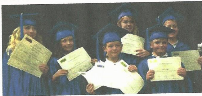
30 Easter Edition 2014